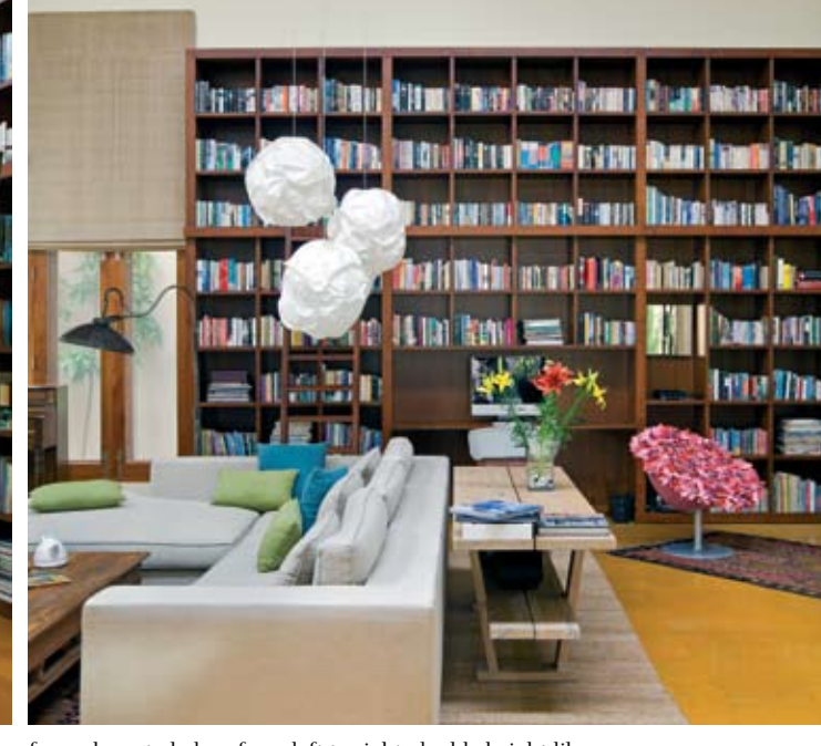
from above to below, from left to right: double-height library opens to verandah, library, library with bookshelves