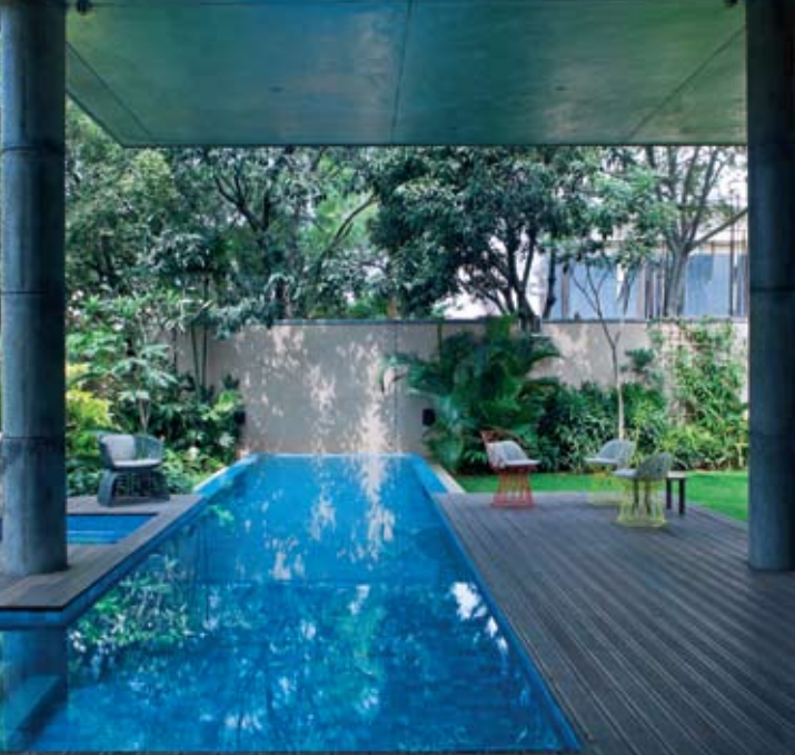
from above to below, from left to right: garden and verandah, view from garden towards swimming pool with first floor bedrooms hovering over, swimming pool